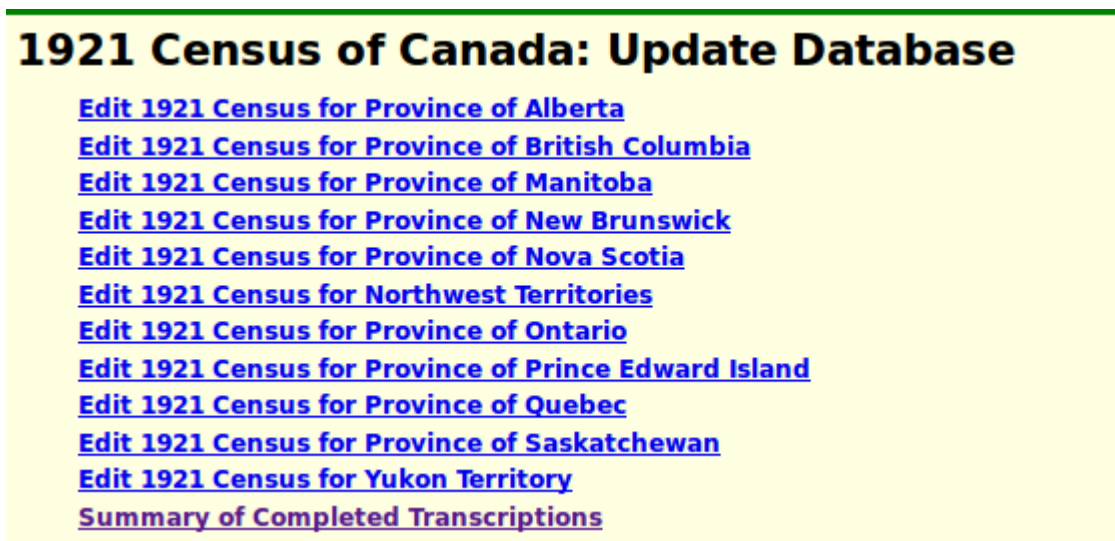
Illustration 6: Main Page for Editing 1921 Census

The page for each census which provided the ability to explicitly identify a page to update by selecting a province, a district, a subdistrict, a division, and a page has been completely redesigned to take you directly into the census transcription status hierarchy. For example the request page for the 1921 census now looks like this: