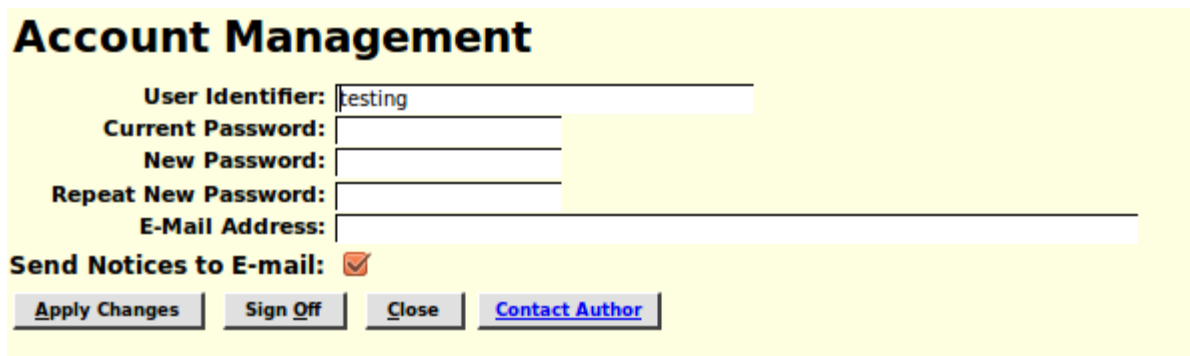
Illustration 3: Account Management Dialog with E-mail Option