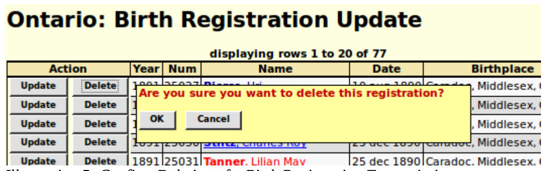
Illustration 5: Confirm Deletion of a Birth Registration Transcription

There are a couple of global changes to the functionality of the site this month. One is the addition of a confirmation popup dialog wherever there is a button to delete information from the database.